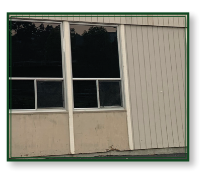
Water damaged siding at Mill Valley Middle School