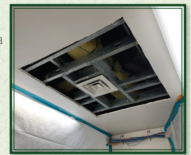
Ceiling damage from recent storm at Mill Valley Middle School

Most of our Mill Valley School District schools were built over 40 years ago. School health, safety and instructional standards have changed significantly over the last decades and our facilities, particularly the middle school, have not kept pace, and are not designed for 21st century teaching and learning.