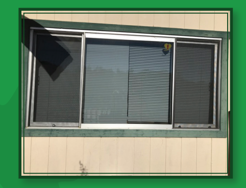
Aging portables at Old Mill Elementary School