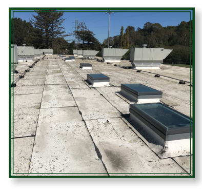
Deteriorating roof at Tam Valley Elementary School

The facility improvements identified at local schools are beyond the scope of the District's current maintenance budget and District leaders are currently evaluating options for funding these improvements. One option under consideration is a school improvement bond measure to provide dedicated, voter-approved, local funding for repairs and upgrades that could only be used for Mill Valley School District facilities.