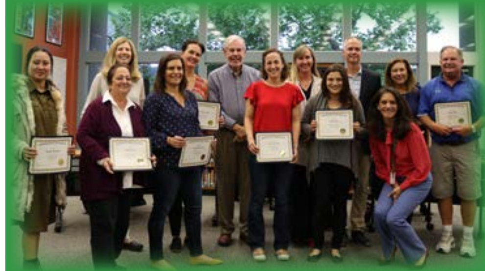
2019 Golden Bell Award Recipients

Indicator of Success Staff feedback, gathered through focus groups, surveys, or other means, will be used to plan and evaluate professional development.